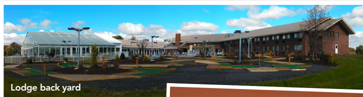
Lodge back yard

To make a reservation, please call the Sales Office at Ladore 570-488 6129 x 157 or e-mail Cathy Feindt – cathy.feindt@use.salvationarmy.org